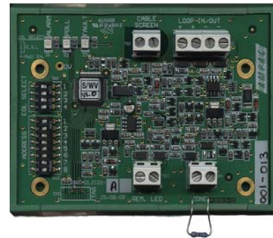
Figure 1 Loop Powered Zone Interface Device (DIN)

The LZID has three onboard LED's for indicating Alarm (Red), Poll/SCI (Green) and Fault (Yellow) conditions.