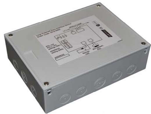
Figure 2 Loop Powered Zone Interface Device (Enclosed)