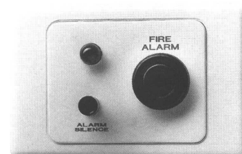
Single Gang Remote Indicator with Buzzer & Mute