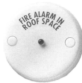
Round Remote Indicator – Fire Alarm in Roof Space