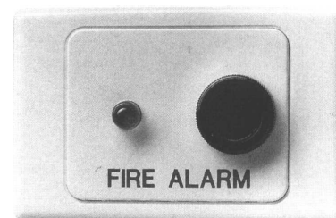
Single Gang Remote Indicator with Buzzer