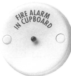
Round Remote Indicator – Fire Alarm in Cupboard