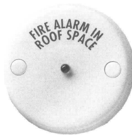
Round Remote Indicator – Fire Alarm in Roof Space