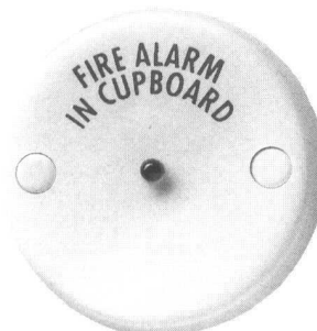
Round Remote Indicator – Fire Alarm in Cupboard