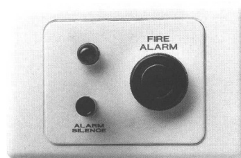
Single Gang Remote Indicator with Buzzer & Mute